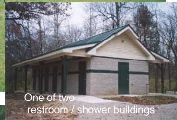
One of two restroom / shower buildings