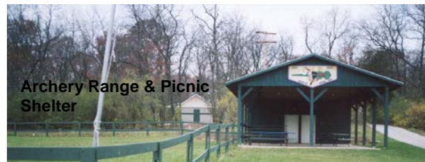
Archery Range & Picnic Shelter