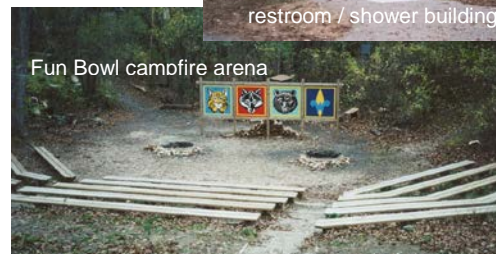
Fun Bowl campfire arena